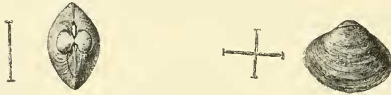
FIG. 3.— Corbicula tribeniensis , sp. nov.

Shell ovately subtrigonal, somewhat inflated, dark brownish olive; umboes rather large, prominent, iridescent; dorsal margin arched; ventral margin gently rounded; anterior side acuminate rounded; posterior side angled above, almost truncate below; both valves very finely and closely striate, covered with a slightly laminiferous periostracum.